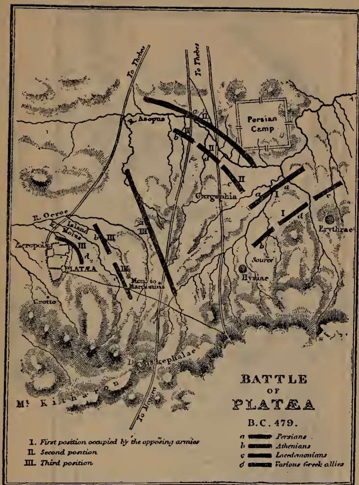
PLAN OF BATTLE OF PLATEA